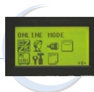
User friendly LCD display