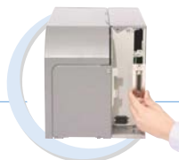
Tri-port Interface options