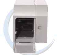
Fanfold media support