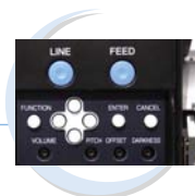
Multifunction operation controls